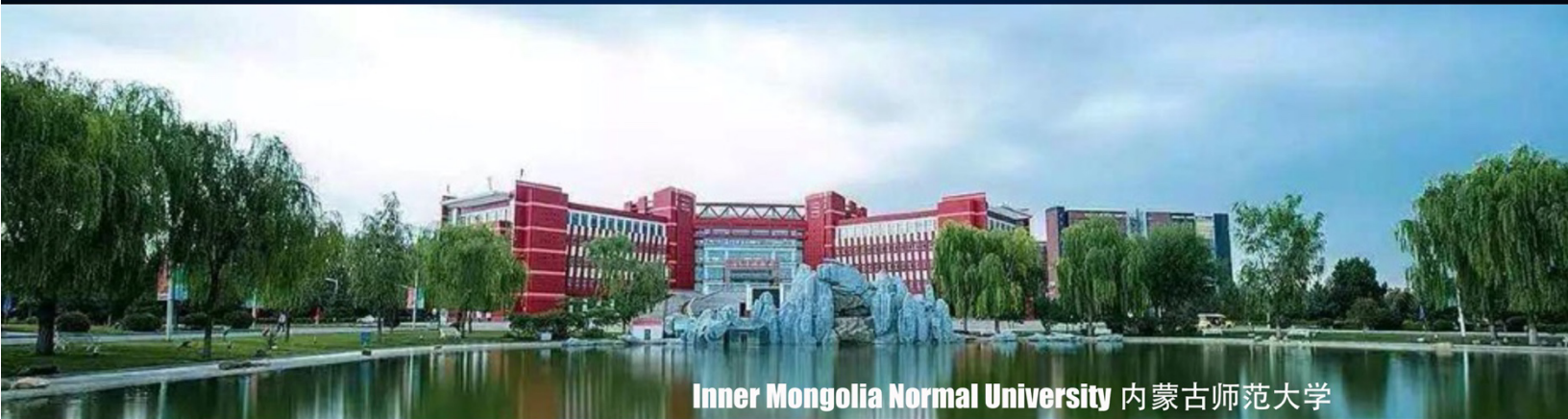
Inner Mongolia Normal University 內蒙古師範大學